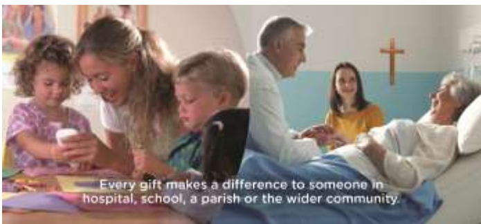
Every gift makes a difference to someone in hospital, school, a parish or the wider community.

33rd Sunday in Ordinary Time — 13 November 2022