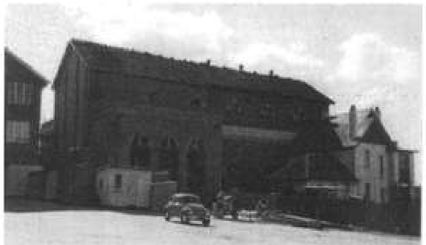
1961 - COMPLETING CONSTRUCTION OF OLD CHURCH