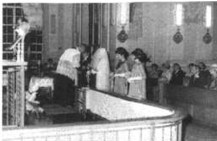
WEDDING - PLAYERS WEDDING, OLD CHURCH 1961